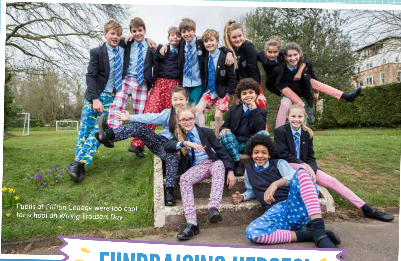
Pupils at Clifton College were too cool for school on Wrong Trousers Day